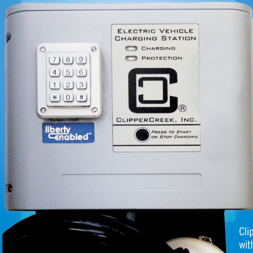
ClipperCreek's CS Series with Access Control

ClipperCreek offers the most innovative, cost-effective Access Control Solution in the industry.